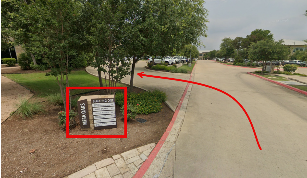
Building number is located in the top right corner.